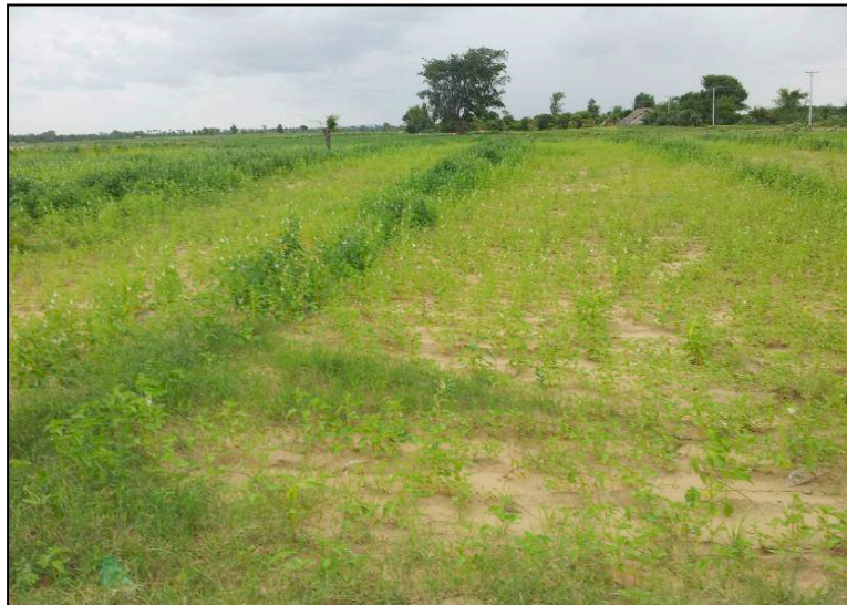
Figure 5 Land changes in a sesame field (This field was previously rented; the light yellowish area is where fertilizer has been applied).

According to farmers' statements, to increase the yield of melons, an estimation of 400kilos per acre of compound fertilizer (15% nitrogen, 15% potash, 15% phosphate) is injected into the field by melon investors. This comparing to normal fertilizer usage of 50 – 100 kilos per acre for rice or less than 50 kilos per acre for groundnuts, has led to soil changes. If in fact, fertilizer use increases production, there is diminishing of returns when it is not applied continuously. After the land is returned, farmers would then cultivate their usual crops and have noticed an increase in their yields, but not for long. After 2 or 3 years that their land is rented, the harvest of the following cultivation season has been reduced on the worst of the cases up to 50% as well as reduced capacity for water retention in a short period. This is because farmers do use cow dung as fertilizer, while melon investors use chemical. While in one hand, cow dung would do much good to the soil, the damage caused by chemicals decelerated production. Furthermore, a local fertilizer trader explained that in order for the soil to recover its fertility, the land would need 3 fallow years, a recommendation that farmers do not follow due to the needs of their household's food production.