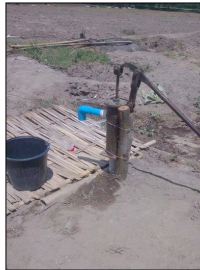
Figure 2 Pump well built in a rented field