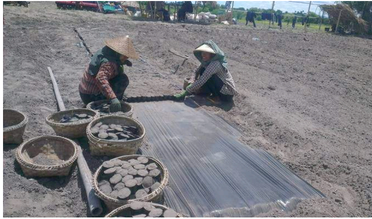
Figure 6 Start of melon plantation